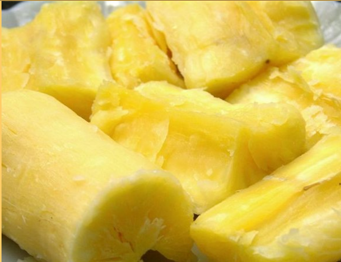
Figure 2. Cooked root of amarelinha do Amapa